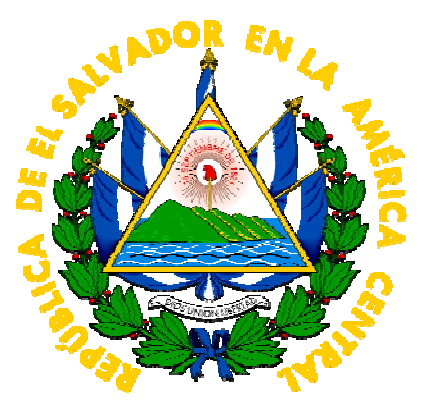
The Republic of El Salvador